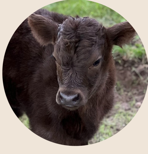
DANIELLE DUN HEIFER CALF