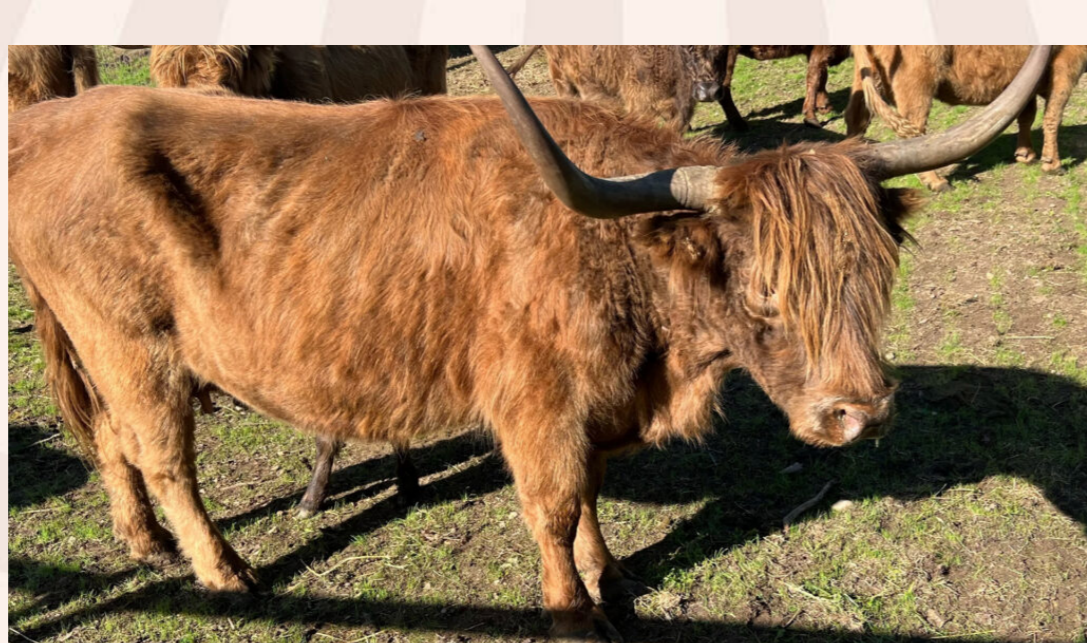
MEET MY MOTHER